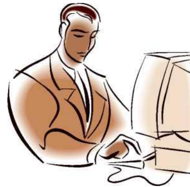
Policy Makers / Practitioners

2017 Branding Study and Analysis of Users' Requirements