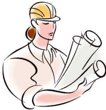
Job Seekers / Learners